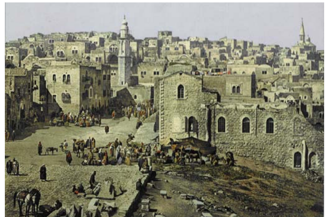
Bethlehem, c. 1880