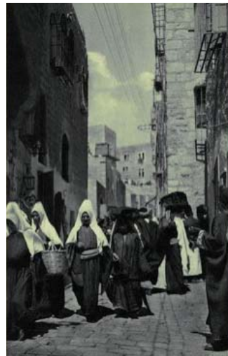
Bethlehem street scene, c. 1915 postcard